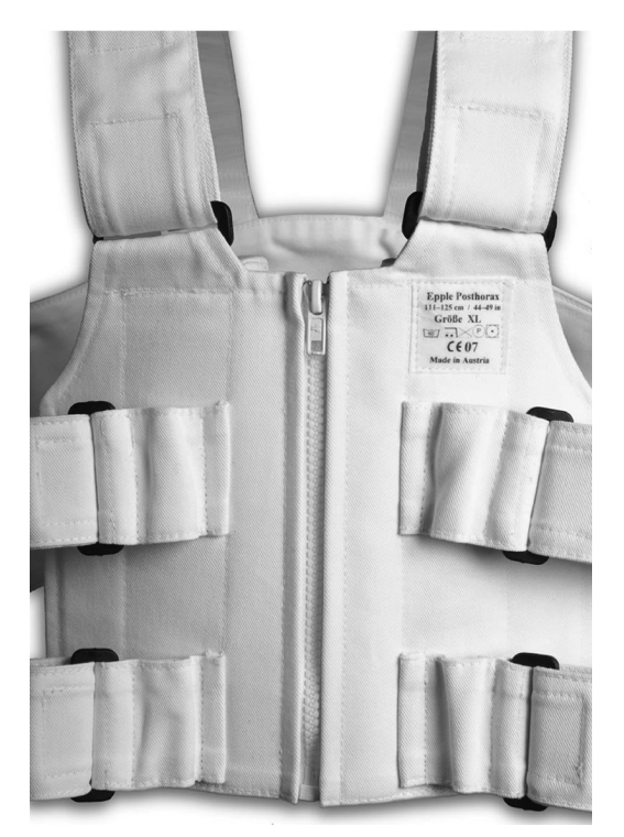
Fig. 2. Front view of the sternum support vest.

The Posthorax<sup>®</sup> sternum support vest (Epple Inc, Vienna, Austria) is a recently developed, patented design (Fig. 2). Its outstanding feature is the fact that pressure and stabi-