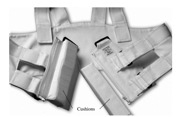
Fig. 3. Two cushions are placed to the left and the right side of the sternum and serve as shock absorbers.

A did not receive the thorax support vest and was treated with an elastic bandage (n=905) while group B received the vest for stabilization of the sternum (n=655). Patients, who refused the vest or did not receive it within 48 h for other reasons, were excluded from the study.