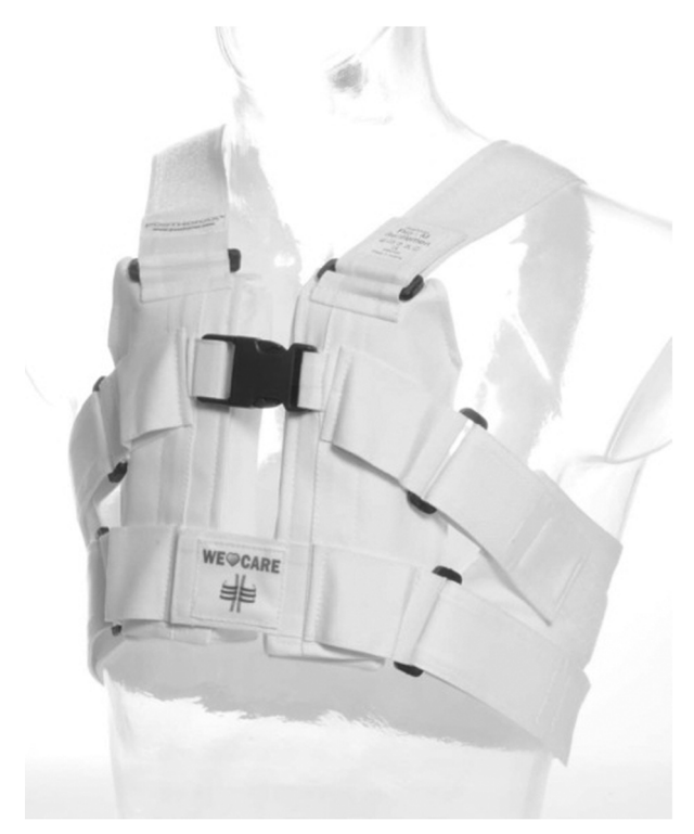
Figure 1: Posthorax® sternum support vest.

The Posthorax® sternum support vest (Epple, Inc., Vienna, Austria) is a recently developed and patented design (Fig. 1). Its outstanding